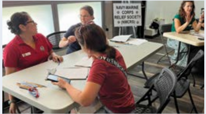
Photo: NMCRS Staff assist clients during Typhoon Mawar relief efforts.

WWW.NMCRS.ORG/OUR-SERVICES/DISASTER-RELIEF