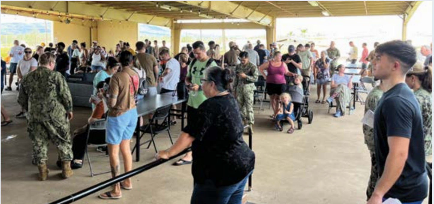
Photo: Clients standing in line to receive Disaster Relief assistance.